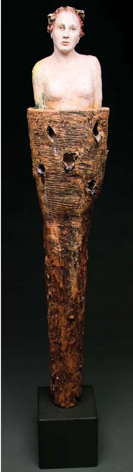
DEBRA FRITTS, RAINKEEPER – LATE SUMMER, CERAMIC, 62 X 11 X 10”